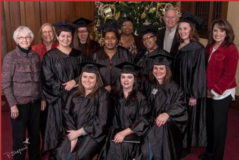
Graduation, December 13, 2017, First United Methodist Church

We had two Getting Ahead in a Just Gettin'-By-World graduations in one week...with congratulations and best wishes all around!