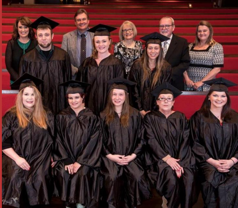
Graduation, December 11, 2017, First Baptist Church