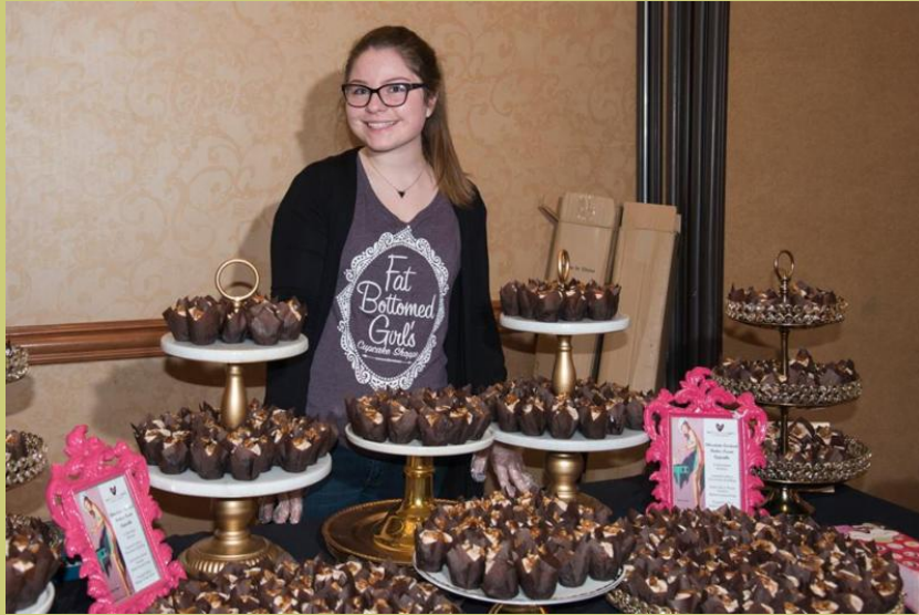
Fat Bottomed Girls Cupcakes