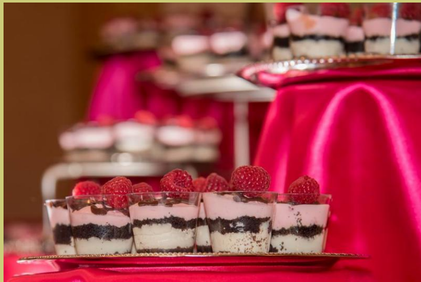
National Park College Hospitality